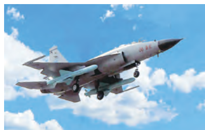
The Air Force